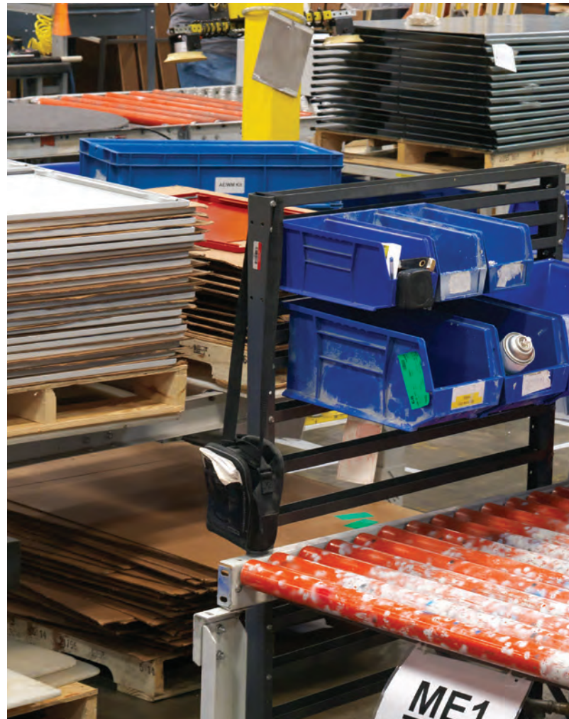
Operators in Rittal's Urbana, Ohio manufacturing facility inspect, assemble and package modified enclosures in preparation for shipping.

Orders must be accompanied with a fully dimensioned, 1-to-1 scaled, Rittal drawing(s) based on drawings downloaded from www.rittal.us or provided by Rittal at time of quote. Products ordered within Xpress will require DWG or DFX file type.