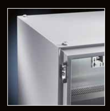
High stability due to selfsupporting integrated construction