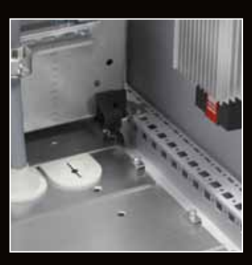
Automatic potential equalisation