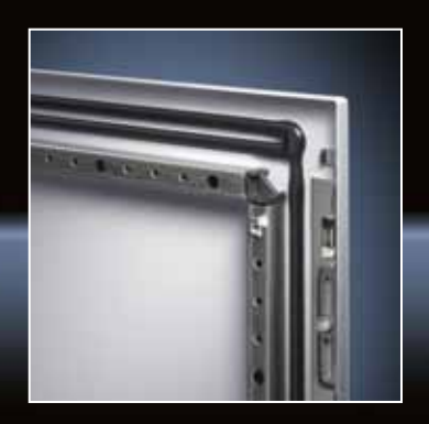
High protection category: IP 55

Sheet steel and stainless steel versions for almost any application area. Thanks to its enclosed basic frame, the SE 8 stainless steel enclosure in particular offers fewer areas for dirt and moisture to collect, and it is easier to clean.