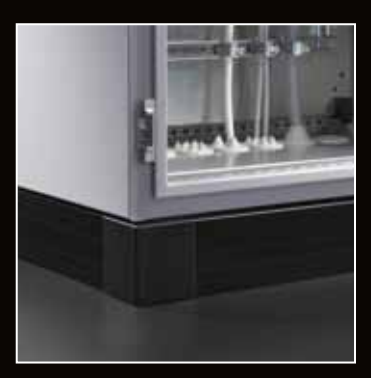
Large variety of bases/plinths: sheet steel, stainless steel or Flex-Block plastic base