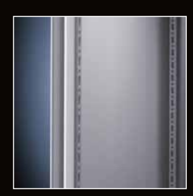
Time saving – Installation can begin directly, no assembly of side and rear panels