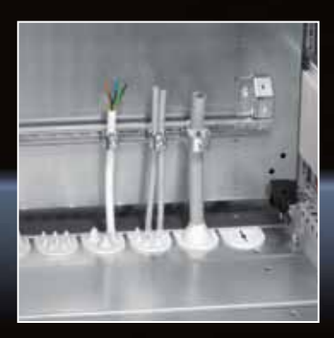
Optimum cable entry