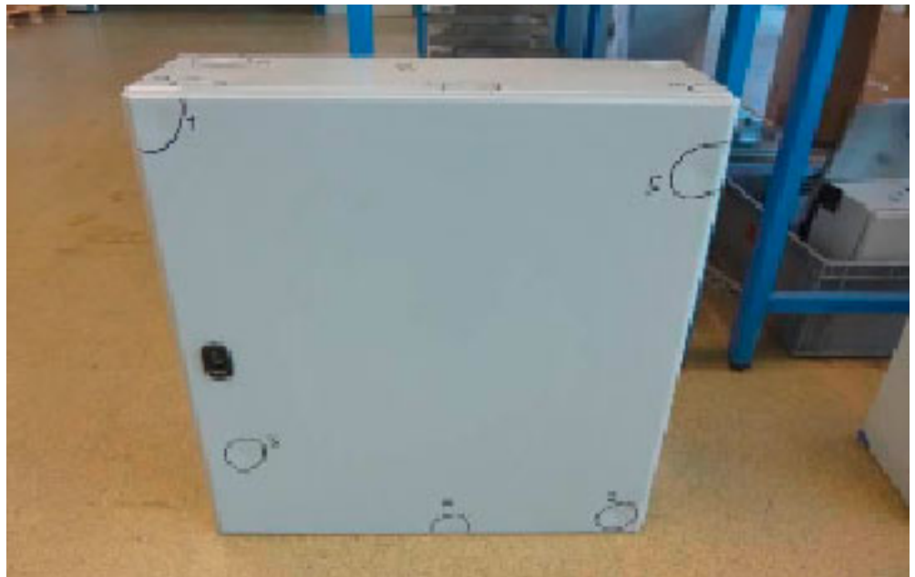
Figure 3: Enclosure in the test laboratory

The enclosure must be appropriately fastened during the test, in the same way that it is used under everyday conditions. This means, for example, that the enclosure may not be tested when freely suspended, as it then is not fixed securely and this is not how it is normally used. Fixing it to the floor or a wall corresponds to the conventional place of use and the requirements of the standard.