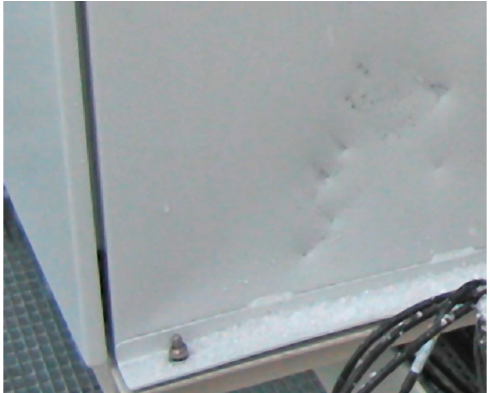
Figure 2: Stress on the enclosure

Besides the IP protection category, the IK Code as per IEC 62 262 is also of significance. This standard defines the classification of the impact resistance of an enclosure, i.e. the degree of mechanical stress or energy impact on the enclosure from the outside. IEC 62 208 states that empty enclosures must retain the IP protection category, as well as the insulation capability and the functions of the housing and its interior. The enclosure should be of good quality, especially where the risk of damage from pallet trucks, forklifts and the like can be expected.