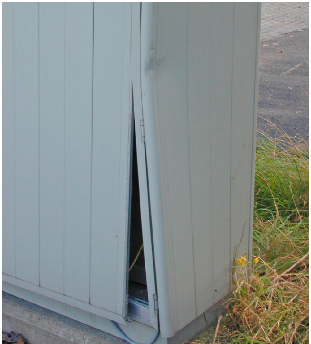
Figure 1: Deformed enclosure following the application of force

Damage to enclosures can impair the function of the equipment installed within (e.g. the control systems of machines) or even, in the worst case, render it non-functional. Accordingly, in addition to IP protection (protection against dust, contact and water), enclosures must also have an adequate level of protection against external mechanical forces.