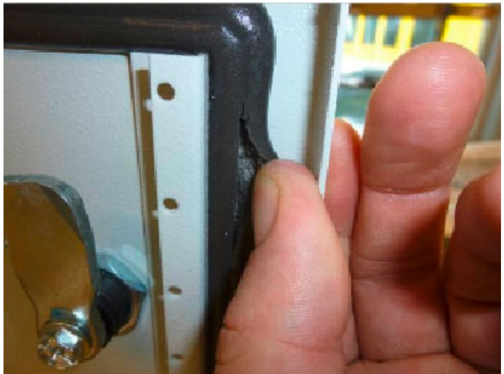
Figure 5: Effects of an IK test

Rittal has its own accredited laboratory. To determine the IK Code, the impact-critical points on the enclosure are checked, following the logic that “a chain is only as strong as its weakest link”. Testing is usually performed on the edge fold of an enclosure. Although this is where the material is most stable, it is here that the seal is located, which can weaken the IP protection category if the edge of the enclosure is deformed from the impact. It is not only important to have a high impact resistance, but also to maintain the enclosure’s functions.