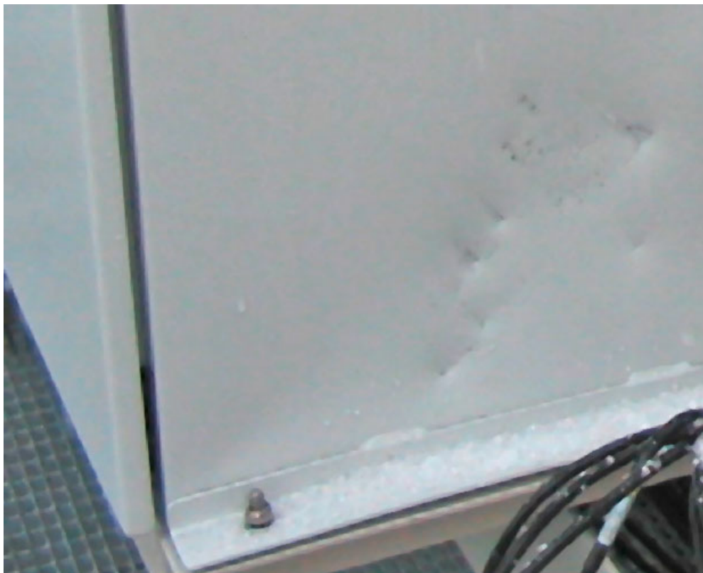
Figure 2: Stress on the enclosure

Besides the IP protection category, the IK Code as per IEC 62 262 is also of significance. This standard defines the classification of the impact resistance of an enclosure, i.e. the degree of mechanical stress or energy impact on the enclosure from the outside. IEC 62 208 states that empty enclosures must retain the IP protection category, as well as the insulation capability and the functions of the housing and its interior. The enclosure should be of good quality, especially where the risk of damage from pallet trucks, forklifts and the like can be expected.