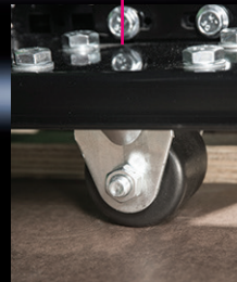
Heavy-duty casters make for safe and easy transport