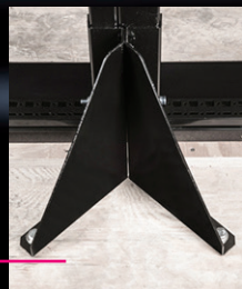
Multi-purpose brackets secure rack to pallet