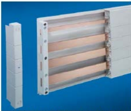
Figure 3 – Busbar System Showing Bottom, Top and Side Covers

Connections to components such as circuit breakers or fuses are made under locking covers or shrouds, in many cases making busbar systems even more touch-safe than the equivalent block-and-cable systems. Figures 3 and 4 show how a cover system provides a high level of contact hazard protection.