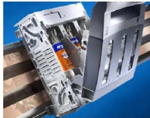
Figure 4 – Class J Fuse Base Adaptor Showing Touch-Safe Housing

Busbar systems neatly organize complex power distribution configurations, essentially simplifying them through superior organization. This level of organization provides enhanced flexibility, which leads to easier system expansion, trouble-shooting and maintenance. From the time a specification is written for a power distribution system to the time it is commissioned, it is quite common for the scope of that system to be expanded. Future expansion can be simplified for the end-user on site by creating initial designs with room for future growth in mind—including unpopulated portions on the bus that are intended specifically for later expansion. Without any additional wiring, new components may be snapped onto a component adaptor, terminated and quickly clamped onto the unpopulated bus system.