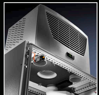
Certified System Integrator