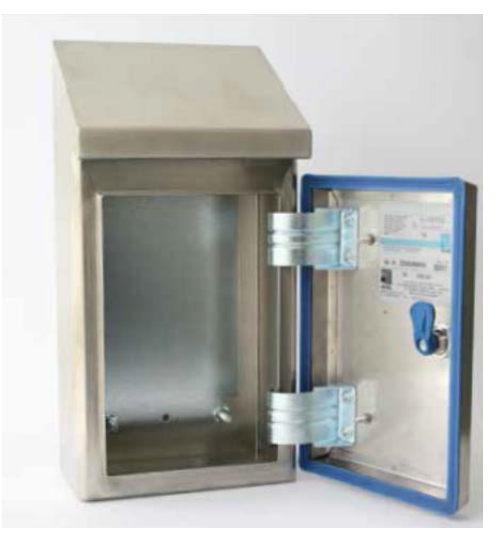
Figure 6: For example, the hinges are located outside the sealing area in an enclosure that is not of hygienic design.