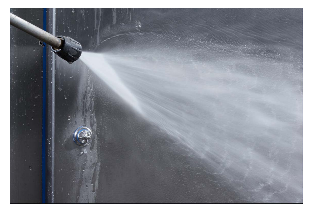
Figure 5: Washdown inserts require enclosures that are maximum leak-proof.

Non-food zone: This can be understood as all other surfaces and areas.