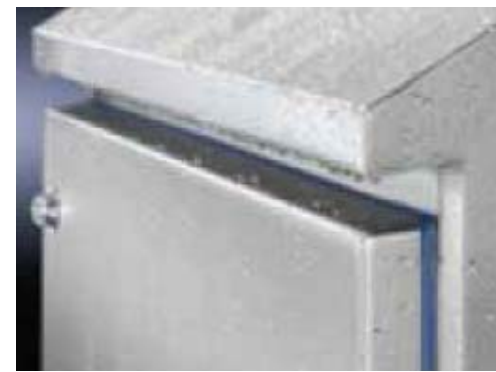
Figure 8: The gaskets of an HD enclosure can be easily replaced.