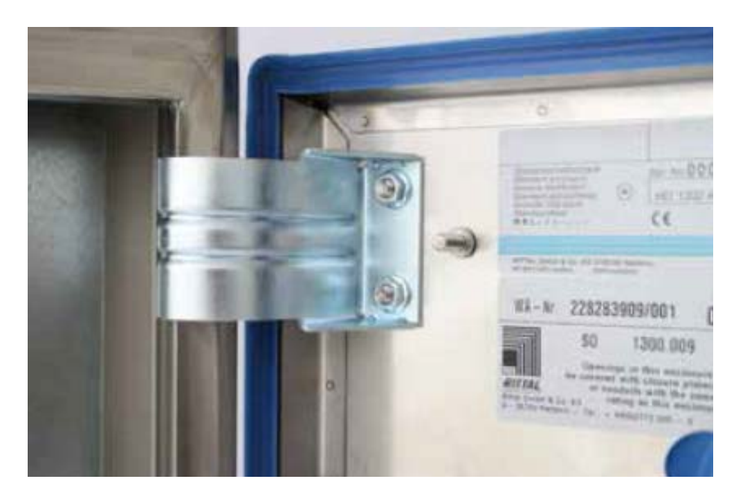
Figure 13: This is how the HD enclosure looked near the upper hinge prior to the experiment.