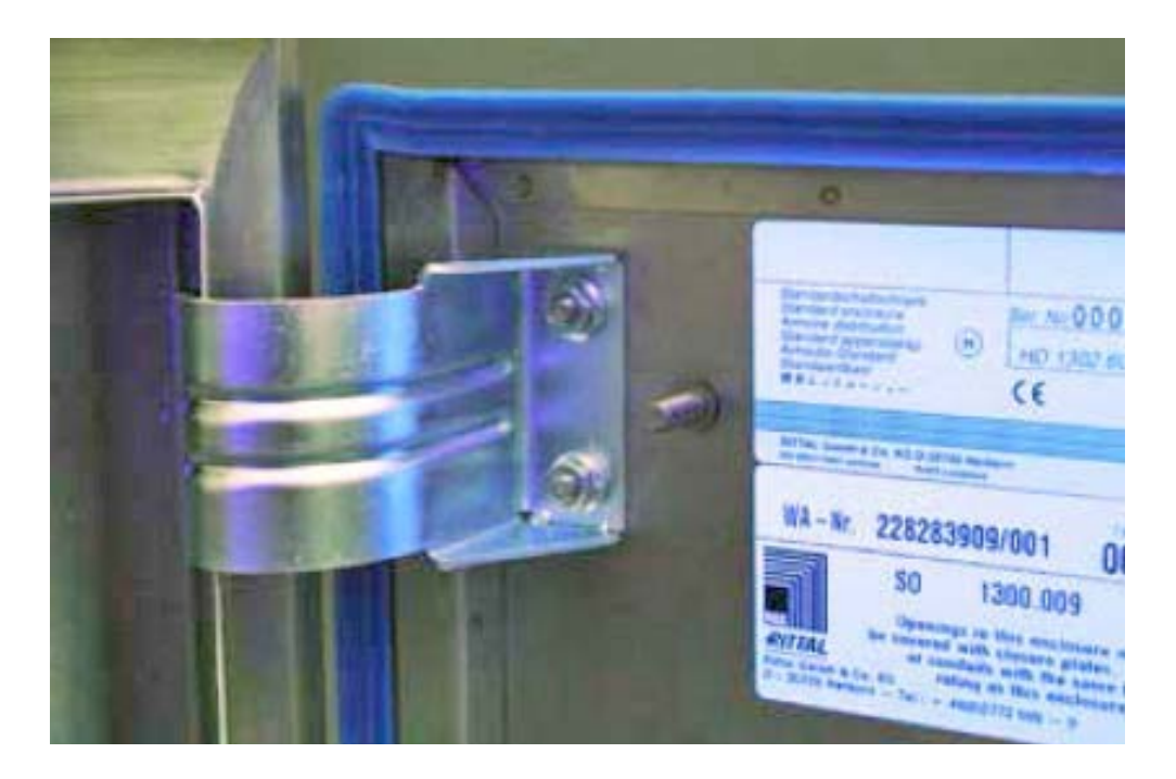
Figure 14: After the test has been performed on an HD enclosure, all the contamination is removed without leaving any residues.