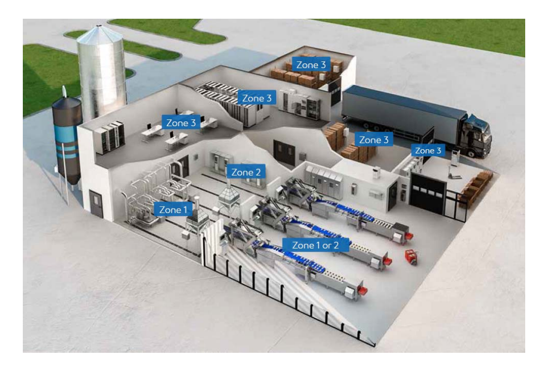
Figure 4: Schematic diagram of the hygiene zones at a company. There are three different types of goods. There are basically three different zones: These are the food zone (zone 1), the spray zone (zone 2) and the packaging and non-food zones (zone 3).

The following checklist will help in selecting the right enclosures and housings for hygienic requirements. The most important question is: In which hygiene zone is the enclosure going to be installed?