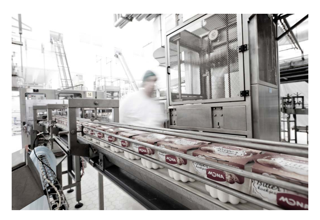
Figure 1: View of a production line at FrieslandCampina, a food manufacturer in Gütersloh, Germany.

This White Paper provides a comprehensive overview of the current and relevant directives, regulations and guidelines, as well as describing their practical application. With the help of this White Paper, you will be able to distinguish more easily between hygienic and non-hygienic enclosure solutions and identify the ideal system to meet your demands.