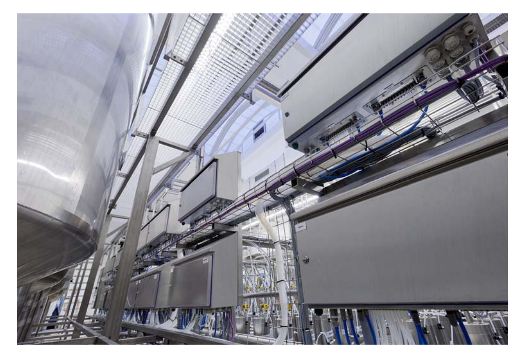
Figure 2: Automation technology at FrieslandCampina is safely protected by Hygienic Design enclosures from Rittal.