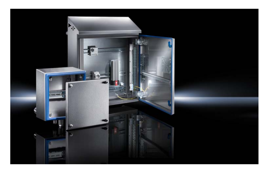
Figure 3: Rittal terminal box and an HD compact enclosure adapted to the requirements of the food and beverage industry.

- Component that could become damaged must be easy to replace (without causing any further damage)