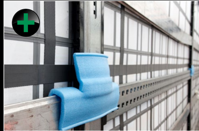
Protective packing on the stanchions. Undamaged inserts to prevent shipping damage caused by friction.