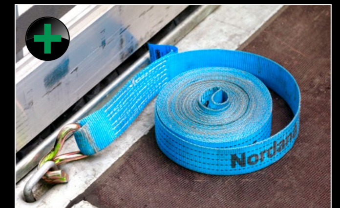
Integrated lashing points on vehicle for securing loads.