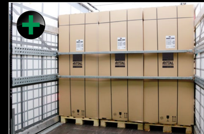
Retaining bars as prescribed load securing equipment on the rear closure.