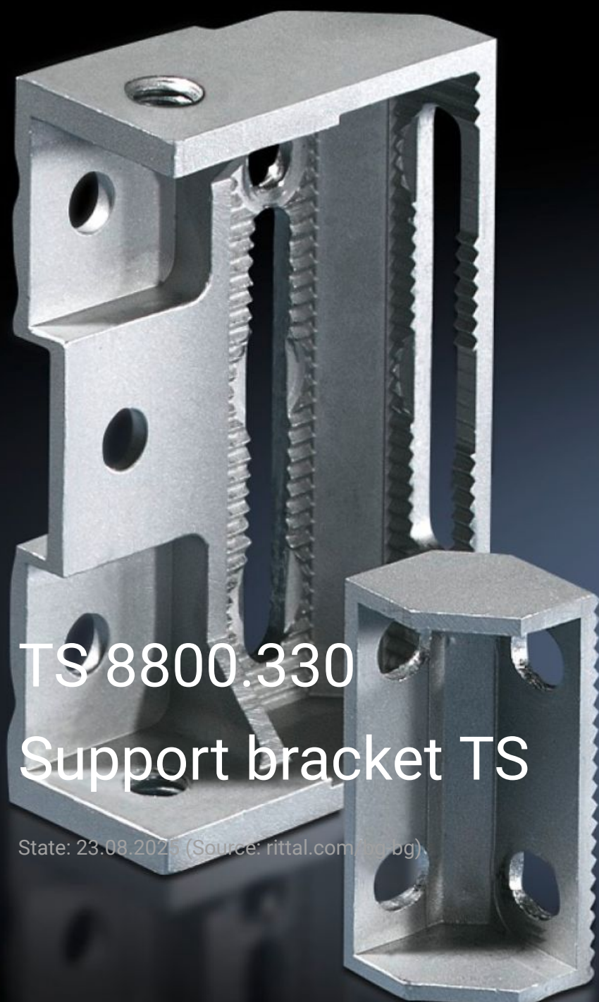
TS 8800.330 Support bracket TS

State: 23.08.2025